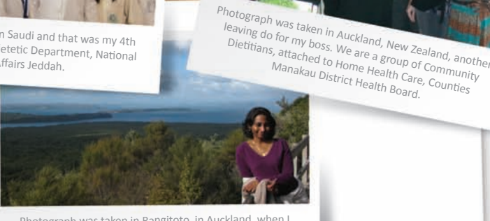
Photograph was taken in Rangitoto, in Auckland, when I went bird watching.

Zealand. Here I worked for a Home Health Care Department, providing nutrition support for malnourished elderly patients and those requiring home enteral nutrition. It was quite a demanding job, necessitating strong organisational skills in order for me to meet my workload; there was little managerial support as practitioners were based in different locations. Being a team player was essential to best address patient care; I often liaised with our multi-disciplinary team to manage my clients. I was fortunate enough to meet some wonderful patients, who often helped to make home visits pleasurable. I once had a Malaysian client who insisted on serving coffee during home visits; on my last visit prior to her being discharged from care, she even baked muffins for me!